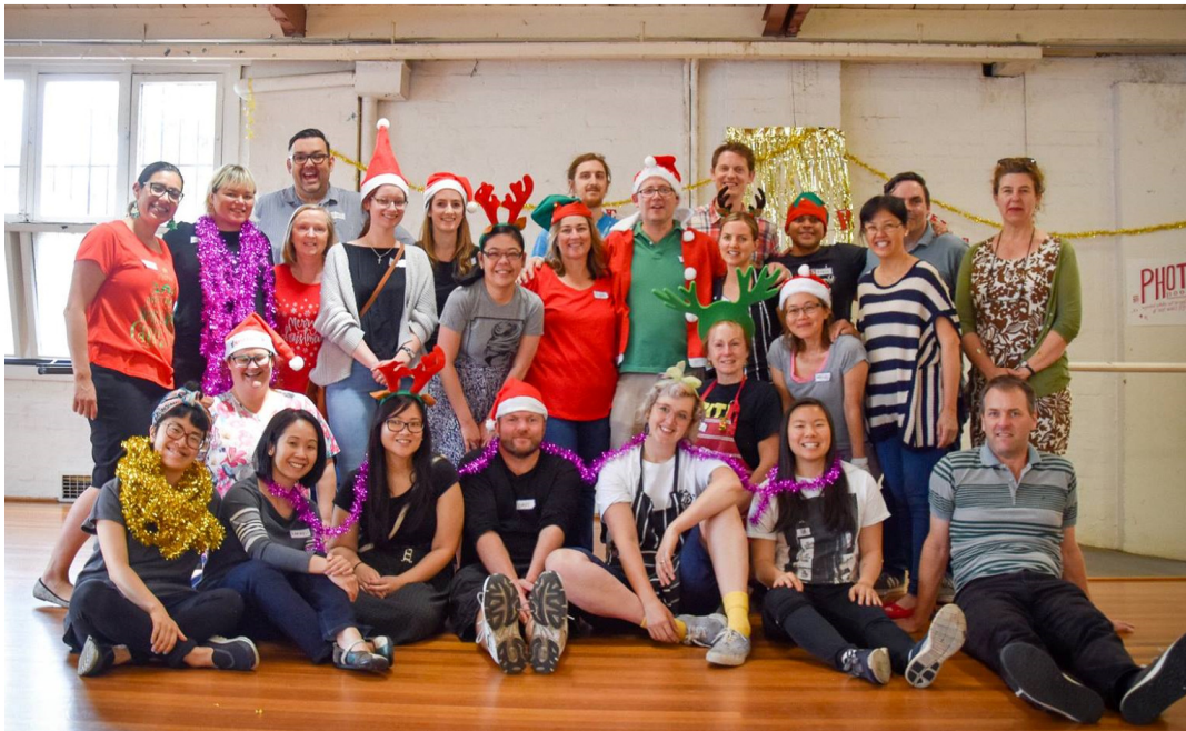
Above: Volunteers from our 2016 Christmas party at The Kitchen

Our survey revealed that a key attraction for people at our services were 'the people' and the 'friendly', 'welcoming' and 'courteous' staff.