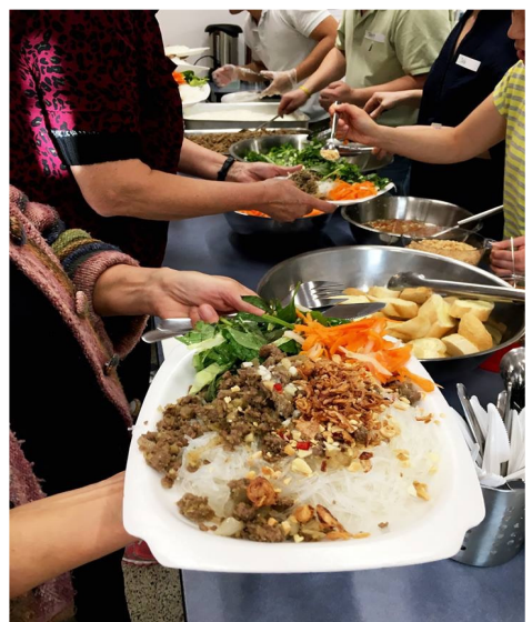
Above: Serving up a delicious Asian style meal at the Friday Kitchen

In July 2017 we did a survey of participants across our Friday and Saturday services and have used the feedback to further improve our service. Key areas for improvement include managing heating and cooling in venues, ensuring foods could be eaten by those with dental issues and ensuring common standards of etiquette in a culturally mixed community.