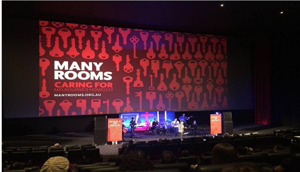
Above: Supporting Many Rooms is promoted at a City on a Hill service

But let justice roll on like a river, righteousness like a never-failing stream. Amos 5:24